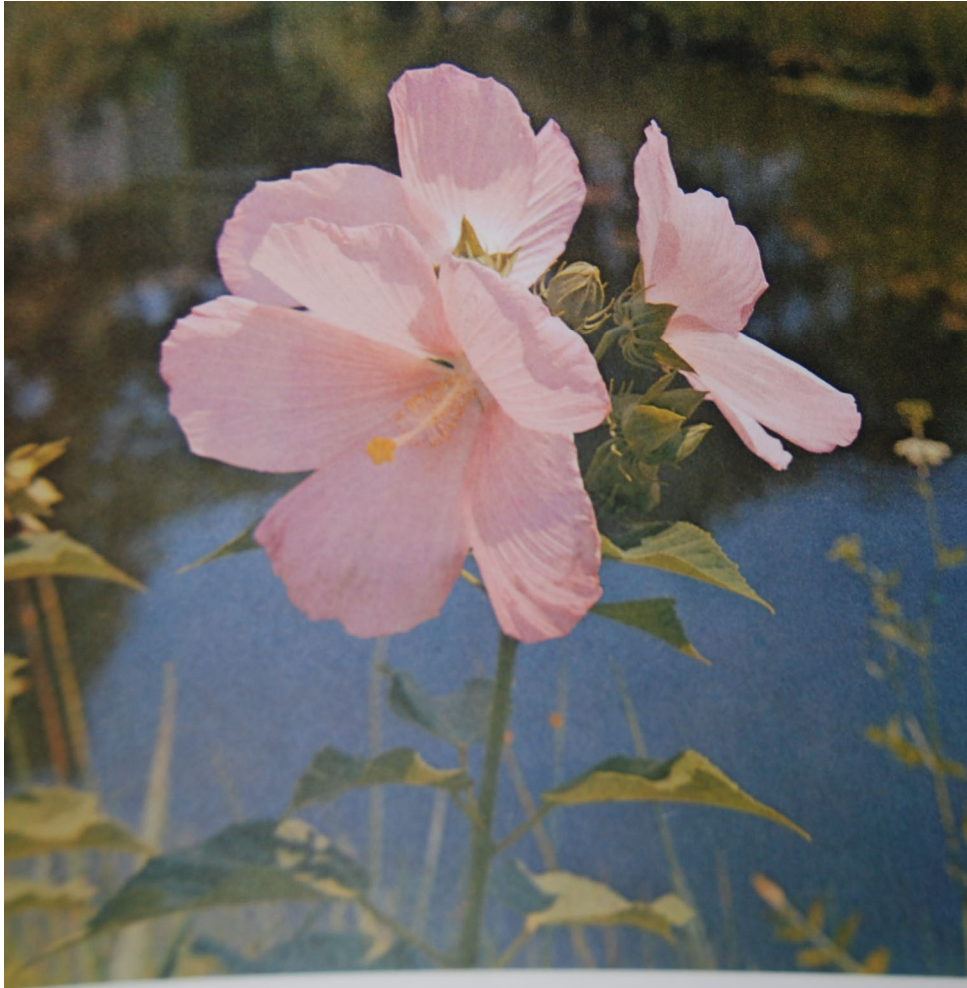
Rickett # 78

1. ALCOTT, Louisa M. AUNT JO'S SCRAP-BOOK ; My Boys, etc. Boston: Roberts, 1842. First Edition. 12mo, pp. [viii], 215. Inserted double frontispiece. Rubbing at the extremities of the spine, contemporary inscription on the flyleaf. Blue cloth stamped in gilt. A very good tight copy. BAL 168. [32773] $250.00